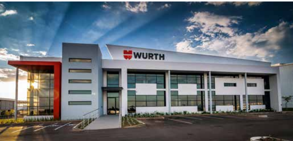
Würth South Africa (Pty.) Ltd. in Gauteng, Südafrika

In particular, we must exercise caution when collecting and processing personal data. We comply with the applicable data privacy and protection laws and appoint appropriate offices and positions to be responsible for compliance.