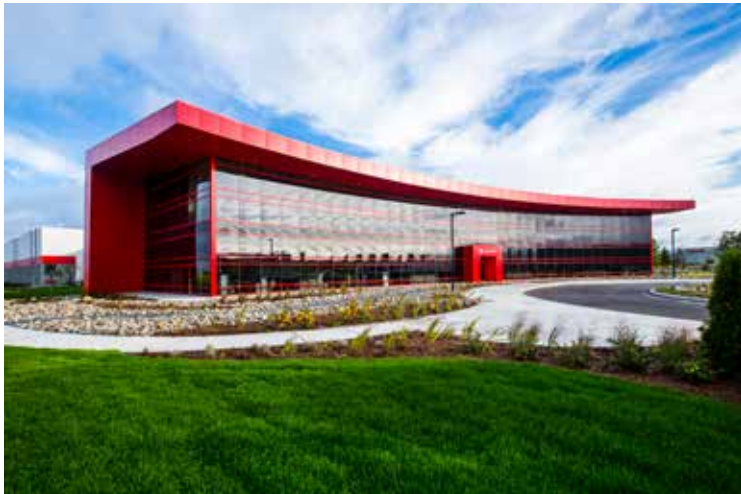
Würth Canada Ltd., Ltée in Guelph, Kanada

Exceptions to this are occasional writing activities, lectures and similar activities that do not interfere with the legitimate interests of the employer. We welcome the voluntary commitment of our employees.