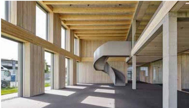
SWG Schraubenwerk Gaisbach GmbH in Waldenburg, Deutschland

The Würth Group recognizes that certain natural resources are limited. We therefore strive to handle natural resources sensibly from an ecological standpoint. This means not only that we comply with existing laws regarding environmental protection and sustainability but also that we attempt to avoid the unnecessary use of non-renewable resources whenever possible. Every employee is therefore urged to implement practical measures to reduce the waste of resources and to avoid creating pollution.