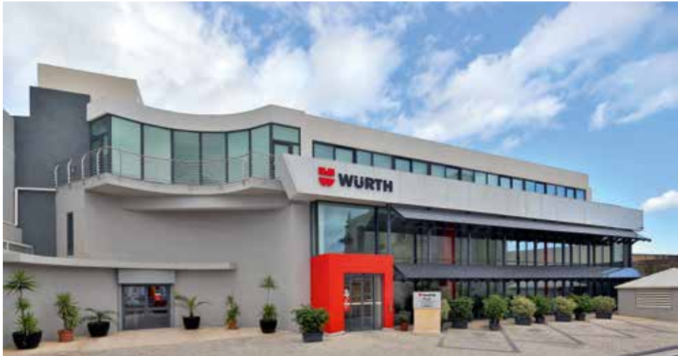
Würth Limited in Zebbug, Malta

We are aware that this applies not only to goods that have a physical presence but also to information and technologies, and that these likewise may not be turned over unlawfully to third parties. Violations can cause enormous harm to the Würth Group. All employees are therefore urged to exercise prudence and, for example, to not pass on information unlawfully via email or over the telephone. Our employees can and should approach their supervisors or the relevant offices whenever there are questions or uncertainties.