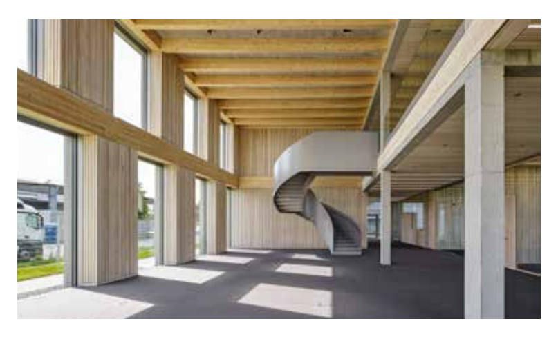
SWG Schraubenwerk Gaisbach GmbH in Waldenburg, Deutschland

The Würth Group recognizes that certain natural resources are limited. We therefore strive to handle natural resources sensibly from an ecological standpoint. This means not only that we comply with existing laws regarding environmental protection and sustainability but also that we attempt to avoid the unnecessary use of non-renewable resources whenever possible. Every employee is therefore urged to implement practical measures to reduce the waste of resources and to avoid creating pollution.